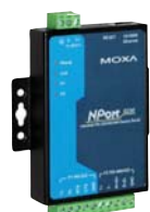
EXC CON 01