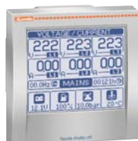
EXC RDU 1 - RGK RA