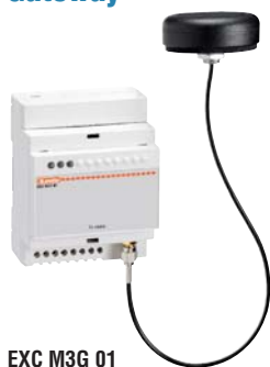
EXC M3G 01