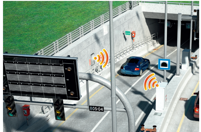
Smart Cities & Traffic Systems